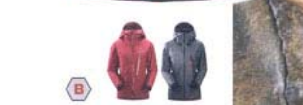
B ARC'TERYX ALPHA SL JACKET $248.95

A full-featured minimalist alpine jacket—the Alpha SL is ultralight (only 12 oz) but includes all the essentials for waterproof protection: laminated die cut Velcro™ cuffs, WaterTight™ front, pit and pocket zips and a laminated quick dry chin guard. XS-L