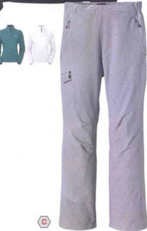
C NORTH FACE CAP PULLOVER $49.95

Lightweight polyester moves moisture and dries fast, lightweight top keeps you worry free when enduring long days. Add the deep-zip front neck and UPF 40+ protection and you know you're staying cool. XS-XL